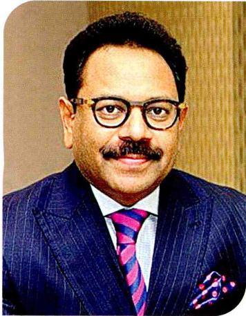
SUMAN BILLA Additional Secretary, Ministry of Tourism Government of India