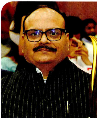
BRAJESH PATHAK Deputy Chief Minister, Uttar Pradesh