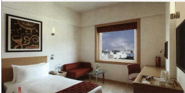
5. Red Fox Hotel Delhi Airport lobby. 6. Standard room at Red Fox Hotel Delhi Airport.

top two or three loyalty programmes in the country), the brand had gained tremendous traction in India. Now with the advent of Social media, the company is actively engaged there as well. "We found that it has worked well for us. The bottom line is that we have had a few million guys who stayed in Lemon Tree in the last few years. I think close to 40% of our guests are repeat. So obviously there is some credence in staying with us. Every time we open hotels now, we just send one email blast to maybe a million people and the hotel stabilises pretty fast," he quips.