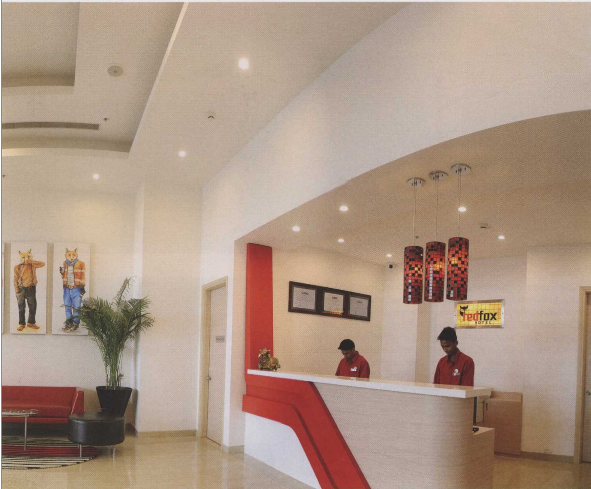
PROFILES LEMON TREE & RED FOX, SECTOR 60, GURUGRAM

he said, "with such a big convention centre we have got a lot of residential queries, because I don't think you have a similar product at our price point anywhere else in the NCR."