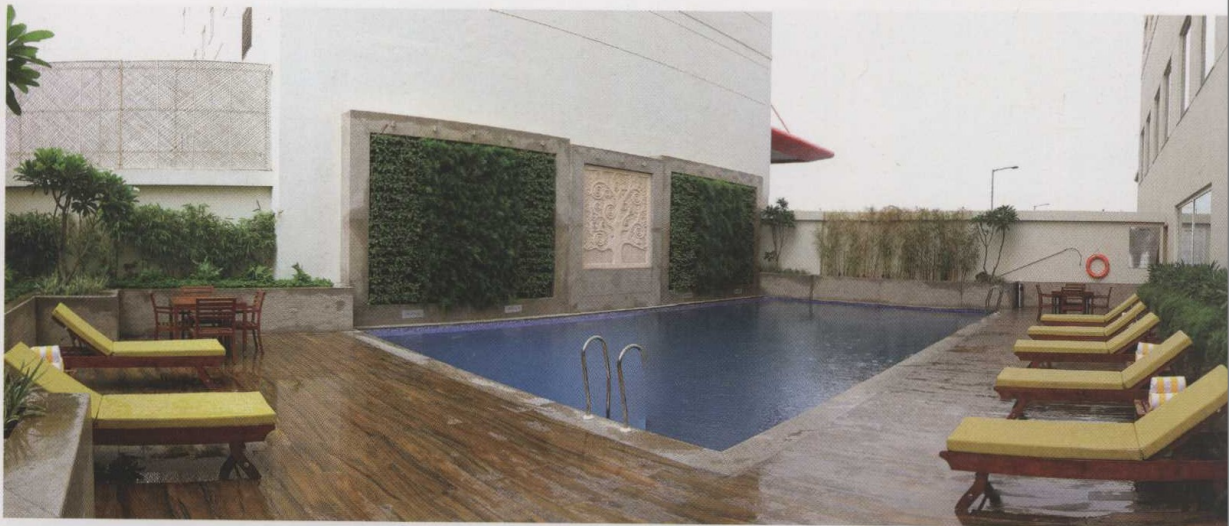
PROFILES LEMON TREE & RED FOX, SECTOR 60, GURUGRAM

the availability of the convention centre, our first exclusive facility. In Gurgaon, there is no banquet hall available in this size at our price point. The only ones available are at five star properties.