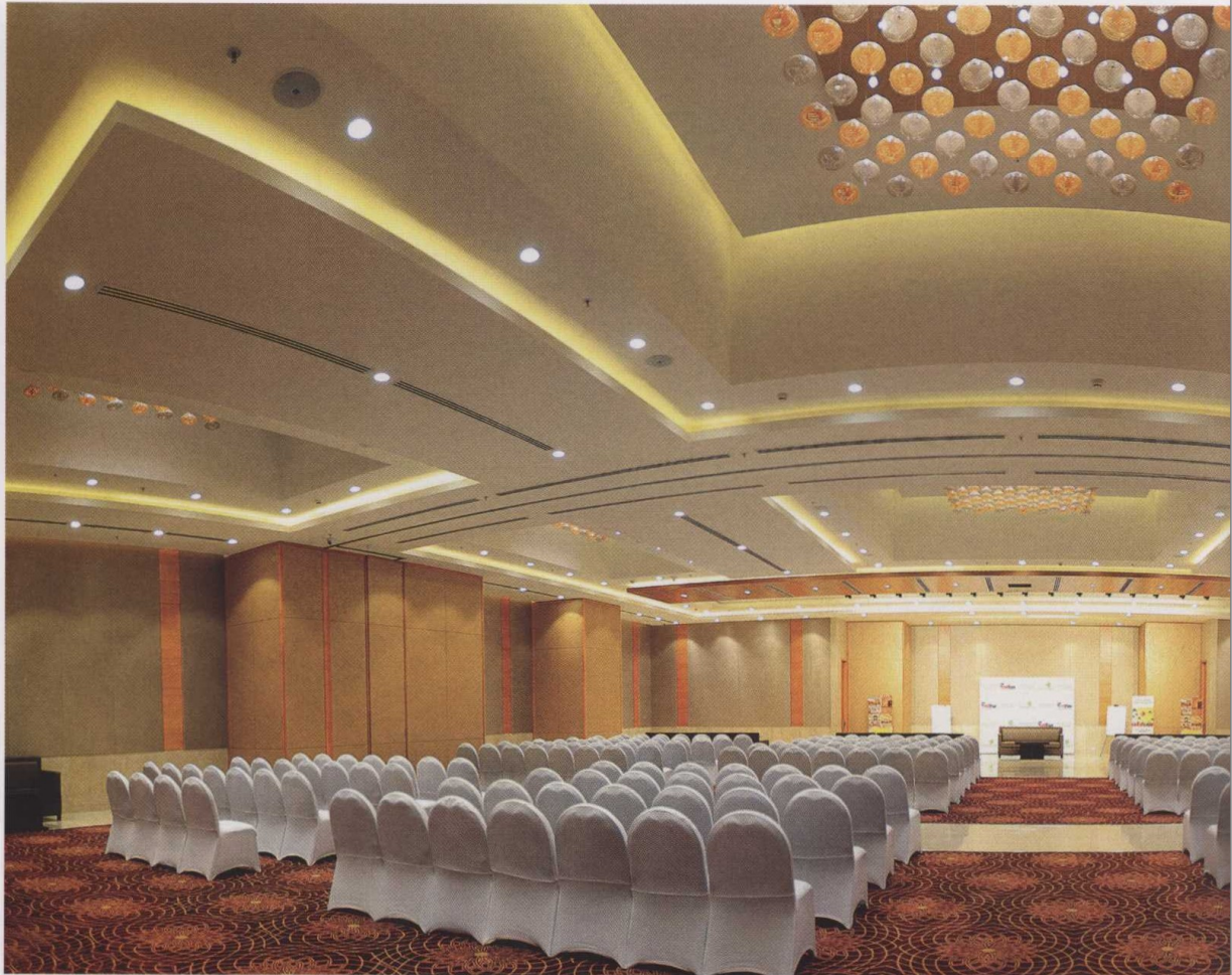
PROFILES LEMON TREE & RED FOX, SECTOR 60, GURUGRAM

Lemon Tree Hotels, which includes Gurgaon, the city with the largest number of Lemon Tree Hotel rooms. In fact, the largest of any single chain, we were informed.