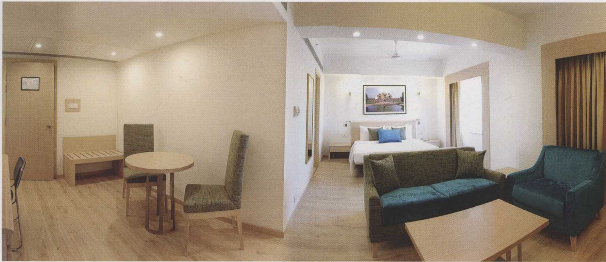
PROFILES LEMON TREE & RED FOX, SECTOR 60, GURUGRAM