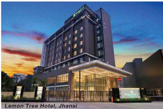
Lemon Tree Hotel, Jhansi

assets are your brand and your culture. "It is there I feel a sense of emotional attachment. For me, the employees determine the brand. Hoteliering is no rocket science. It is delighting the five senses of your customers: it is whether you like what you see, smell, taste, touch and hear," he feels.