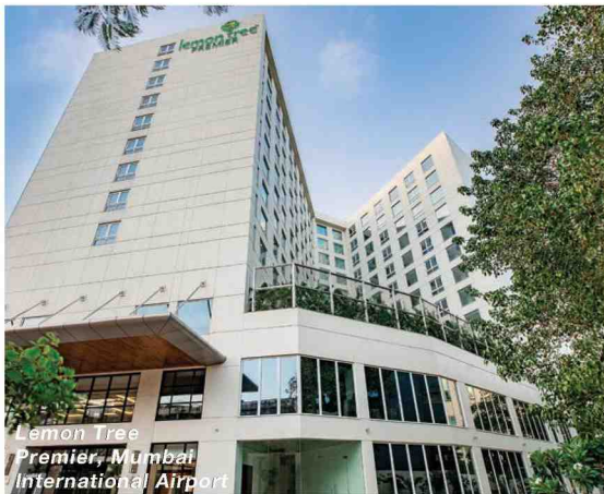
Lemon Tree Premier, Mumbai International Airport