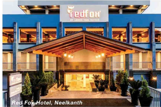
Red Fox Hotel, Neelkanth