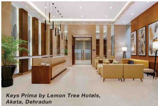
Keys Prima by Lemon Tree Hotels, Aketa, Dehradun