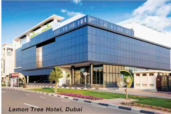
Lemon Tree Hotel, Dubai