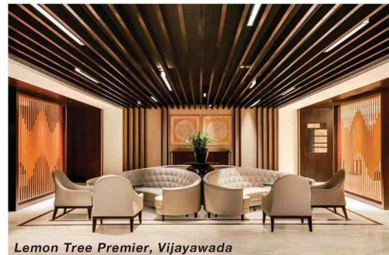
Lemon Tree Premier, Vijayawada

A huge cornerstone at LTHL has been diversity and gender inclusion and there are few parallels to this direction and effort. On this, the Lemon Tree Chairman says, "We have a definition in Lemon Tree called Opportunity Deprived Indians (ODI) where EWDs, or employees with disability, who could be differently abled physically and/or mentally and EcoSocs, who could be economically, educationally, socially or geographically challenged individuals are offered opportunities. We were moving towards having 20 per cent of them in our team but then Covid19 came and there was some attrition. We will soon get back there. We intend to make such people, irrespective of background, disability or lack of formal education and training functionally literate. The ODI initiative has helped us access a completely untapped and ignored talent pool."