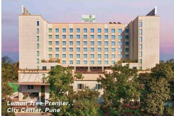
Lemon Tree Premier, City Center, Pune