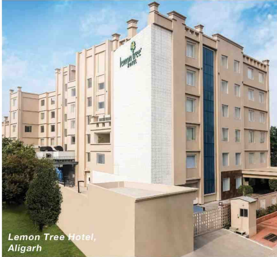
Lemon Tree Hotel, Aligarh