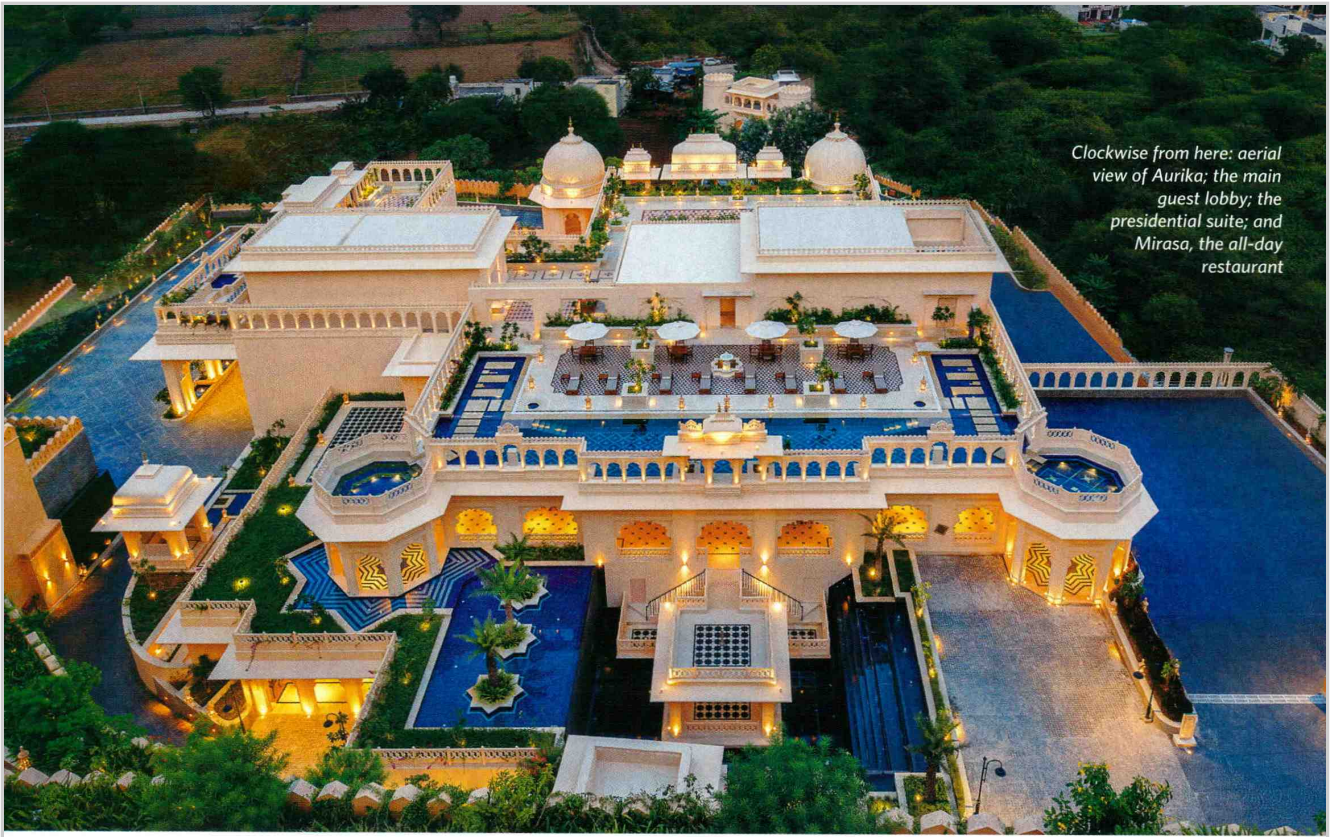
Clockwise from here: aerial view of Aurika; the main guest lobby; the presidential suite; and Mirasa, the all-day restaurant