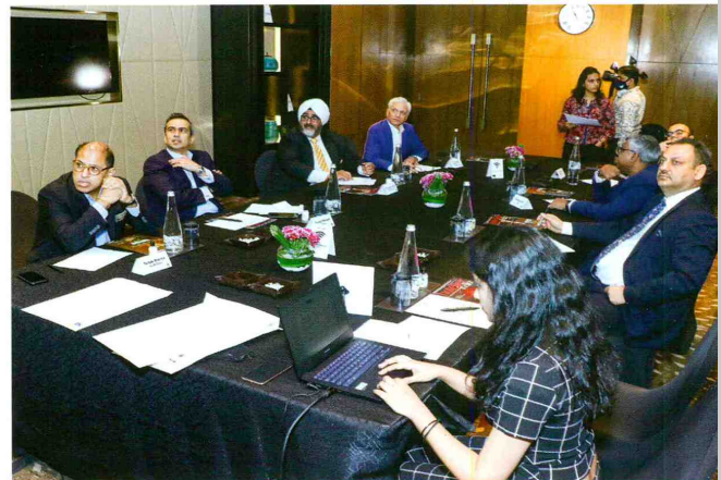
➡ The jury whittled down the long list of names in each category down to a set of five to six finalists per category.

The jury members then retired to three separate rooms to go through specific award categories in three segments - Luxury, Midscale and Economy. Over the course of the day, they deliberated over each nomination in detail and assigned points for