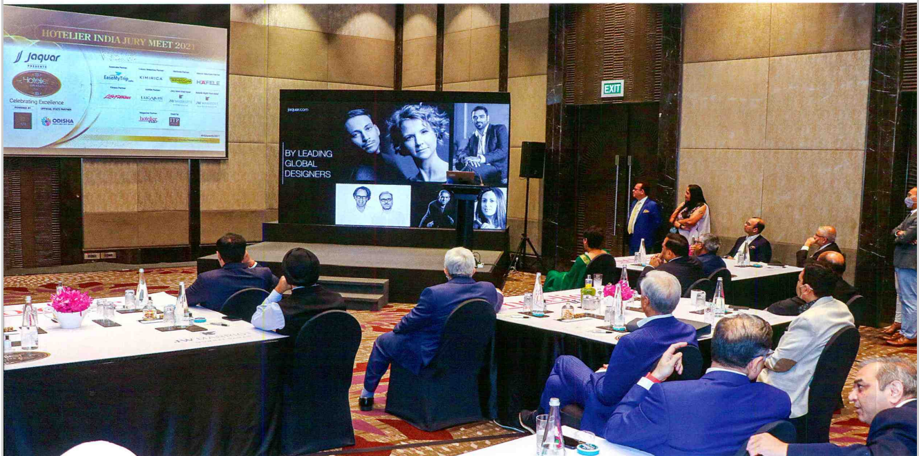
The 12 th Hotelier India Awards is all set to rejuvenate the industry's spirit, which is working aggressively towards business recovery.