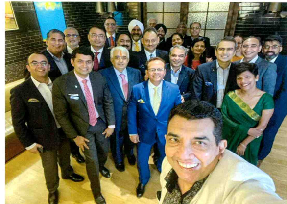
➡ It was not all work for the jury, they also indulged in some friendly banter, and selfie moments!

very challenging year. Through this recognition there will be restored confidence with further inspiration to never give up hope even in extreme difficulties and achieve resiliency in the business operations," he opined.