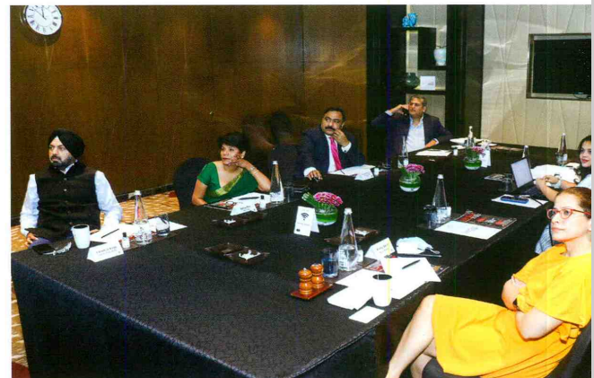
➡ Over the course of the day, jury members deliberated over each nomination in detail and assigned points for every candidate after their discussions.