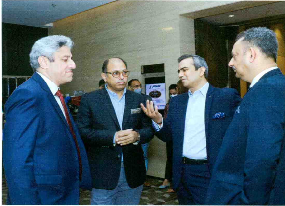
➡ Several jury members opined that appreciation in any form goes a long way in boosting confidence.

every candidate after their discussions.