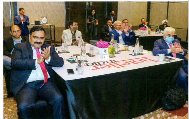
➤ As the voice of India's hospitality industry, the Hotelier India Awards plays a significant role in lauding the talent powering business recovery, thus leading to a positive change.